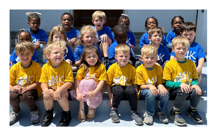
"You're off to great places! Today is your day! Your mountain is waiting, so... get on your way!" - Dr. Seuss, Oh, The Places You'll Go!